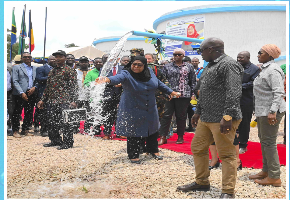
Mhe. Dkt. Samia Suluhu Hassan, Rais wa Jamhuri ya Muungano wa Tanzania akizindua mradi wa maji wa Kakonko, Kiziguzigu tarehe 16 Oktoba, 2022

HOTUBA YA WAZIRI WA MAJI MHE. JUMAA HAMIDU AWESO (MB), AKIWASILISHA BUNGENI MAKADIRIO YA MAPATO NA MATUMIZI YA FEDHA YA WIZARA YA MAJI KWA MWAKA 2023/24